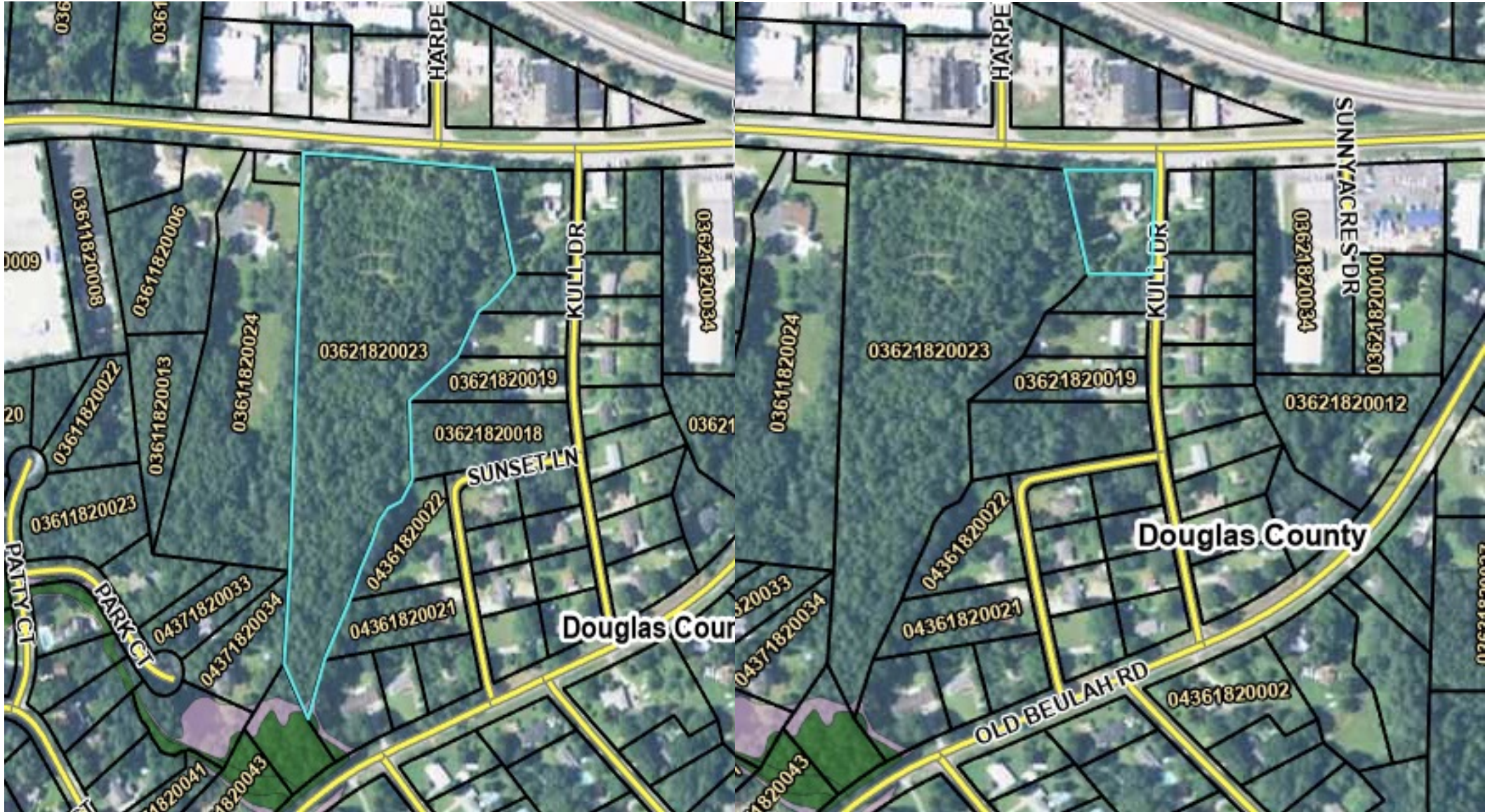
Two tracts – total 9.47 acres